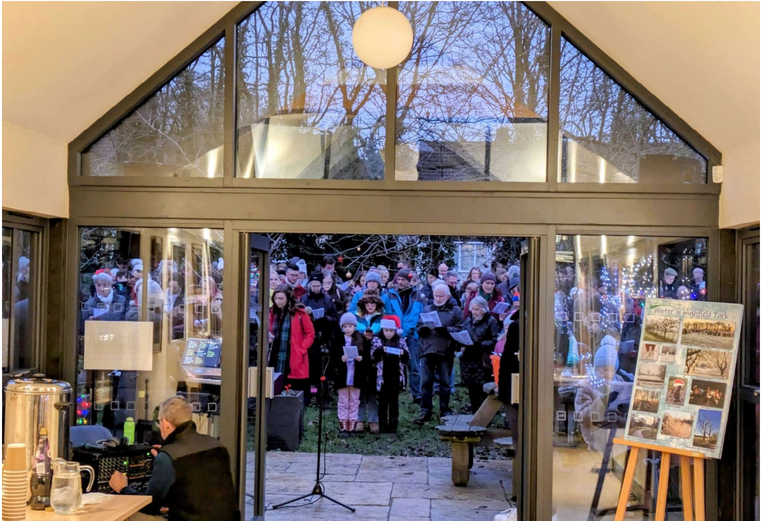
Carols in the Park—The Big Sing.