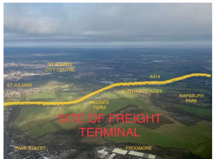
Position of the Rail Freight Terminal

proposals to build on some of the land adjacent to Highfield Farm, although I have not been able to find the relevant proposals or determine the exact positioning online. These plans have not progressed at the moment, but it seems logical from the above that it is only a matter of time before they are. At some point Highfield Farm is also likely to be affected. The area is currently 'safeguarded' in the HCC minerals plan, which runs until 2041. The consultation for this has now closed, of course.