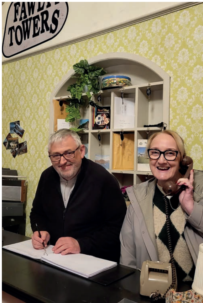
Colney Heath Theatre Club is a not-for-profit organisation working for the benefit of the local community.