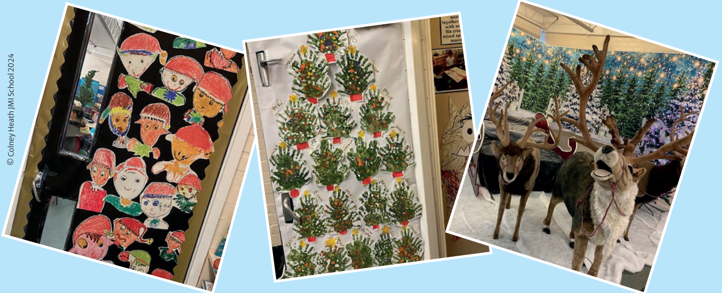
© Colney Heath JMI School 2024