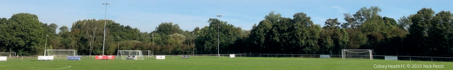
Colney Heath FC