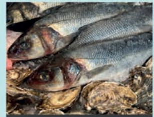
FISHMONGER FRIDAY / SATURDAY / SUNDAY

Our beautiful store is packed with items to delight and the cafe has tasty breakfast and lunch.