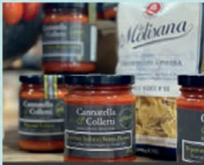
FOODHALL AND CAFE

10% OFF EVERYTHING IN SHOP & CAFE WITH THIS FLYER