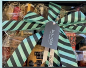
GIFTS AND HOMEWARE