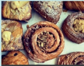
BUTCHER AND BAKERY